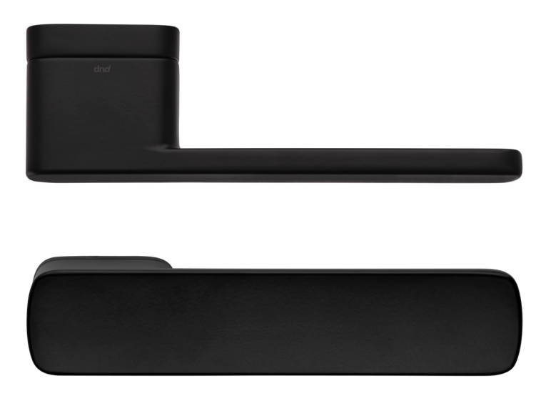
A handle with a sharp, clean and essential design finds its shape in a rounded rectangular volume. The escutcheon is contained within the projection of the lever.